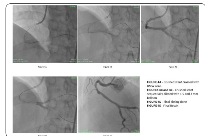
Figure 4A: Crushed stent crossed with BMW wire