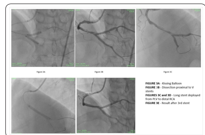
Figure 3A: Kissing Balloon